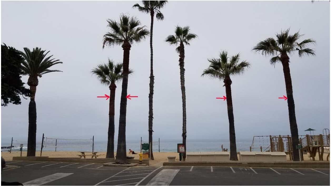
View from Emerald Bay Main Beach Parking Lot 4 Date Palms Identified