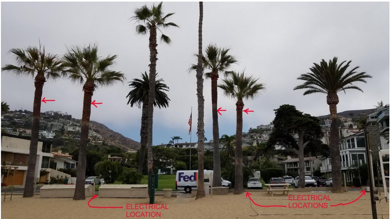
View from Emerald Bay Main Beach 4 Date Palms Identified & 3 Electrical Outlets